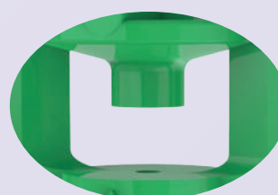
Uniform Spray pattern