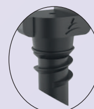
Easy and fast installation